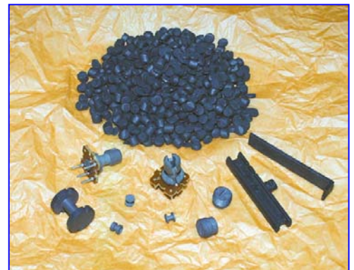
FSCP materials in injection moulding granules with moulded parts